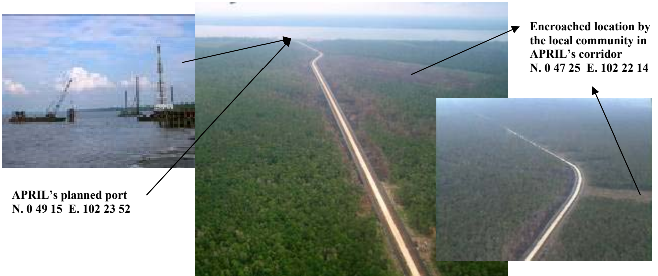
APRIL's planned port N. 0 49 15 E. 102 23 52

The new road is 27 kilometer long and 12 meters wide, flanked by 40 meters of road side, canal and opened forests on either side. The rest of the road covering the distance between APRIL's mill to the new port passes through 53 kilometers of APRIL's Industrial Timber Plantation partners and concession.