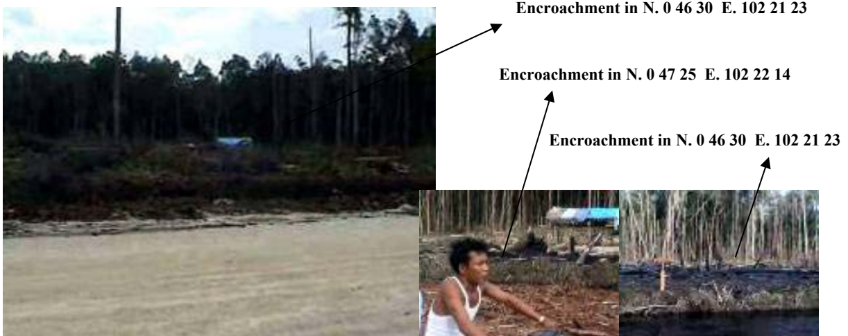
Image 5, 6 and 7: Encroachment locations along APRIL's logging road in Kampar Peninsula (Photos: Jikalahari, April 5, 2005)

Further, some new encroachment locations were found along the new road. People from Tanjung Pal and Sungai Rawa Village are encroaching the area newly opened for the road for agriculture and plantation development. During interviews, they told JIKALAHARI that three kilometers of land where the new road was built falls into their traditional communal land rights. APRIL showed no response regarding the local people's development activities. This could be interpreted as verifying the status of communal land rights of the newly built road.