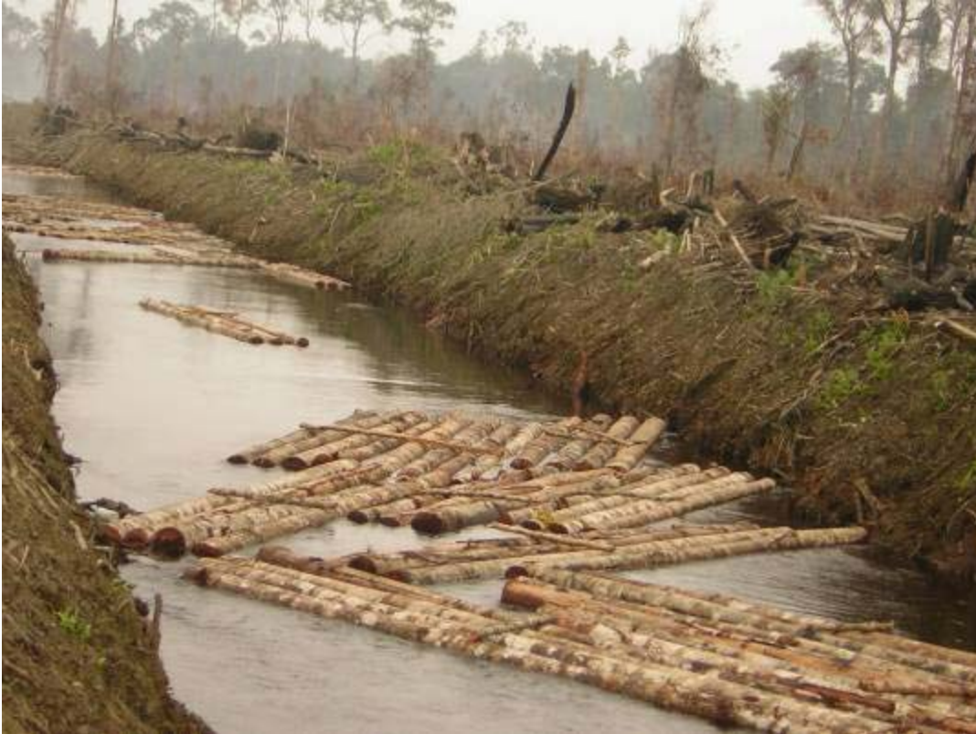
Image 8. Illegal logging in APRIL's logging corridor in Kampar Peninsula, Latitude: 0.81331551 Longitude 102.3937905

In 2004, APRIL opened yet another road along the northern boundary of the Tesso Nilo forest. Immediately, the number of new settlers in the area increased significantly. Based on FCU surveys, the number of families in Dusun Sei Medang have increased from 43 families in 2002, into 300 families in March 2005. Most of them are immigrants from outside Riau province.