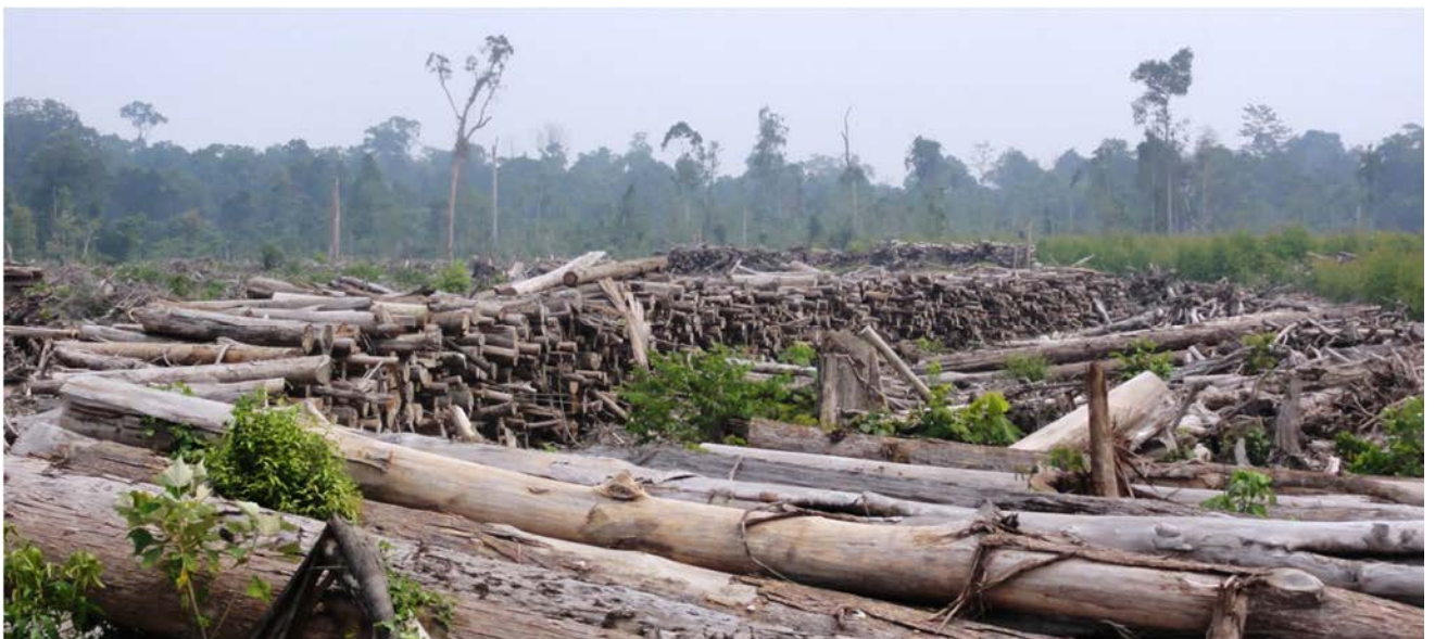
Photo 2. Logyard of PT. Artelindo Wiratama shows the timber supplier of APP clearcut tropical rainforest for raw material that would be sent to pulp mill of PT Indah Kiat Pulp & Paper (IKPP). This forest clearcutting occurs in good natural forest that should be protected as it is habitat of Sumatran tiger. Photo in location S 0° 47' 4.39" E 101° 51' 1.84". EoF, 30 September 2011