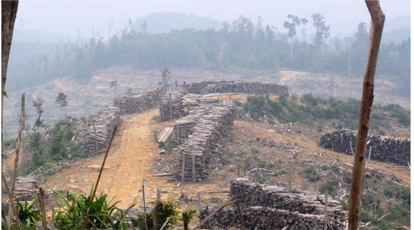
Gambar 5. . Logyard of PT. Artelindo Wiratama where the timber supplier of APP clearcuts tropical rainforest for raw material that would be sent to pulp mill of PT Indah Kiat Pulp & Paper (IKPP). This forest clearcutting occurs in good natural forest that should be protected as it is habitat of Sumatran tiger. These MTHs are decayed and rotten as they are stranded in the location for a long time. Photo location S 0° 46'34.78" E 101° 51'59.05". EoF, 30 September 2011.