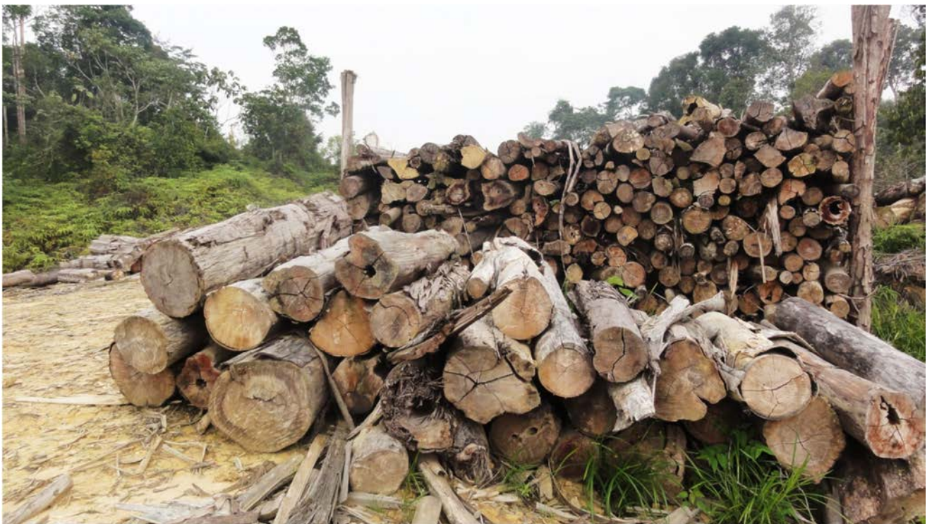
Photo 4. Logyard of PT. Artelindo Wiratama where the timber supplier of APP clearcuts tropical rainforest for raw material that would be sent to pulp mill of PT Indah Kiat Pulp & Paper (IKPP). This forest clearcutting occurs in good natural forest that should be protected as it is habitat of Sumatran tiger. Photo in GPS location S 0° 47'50.74" E 101° 50'9.05". EoF, 30 September 2011