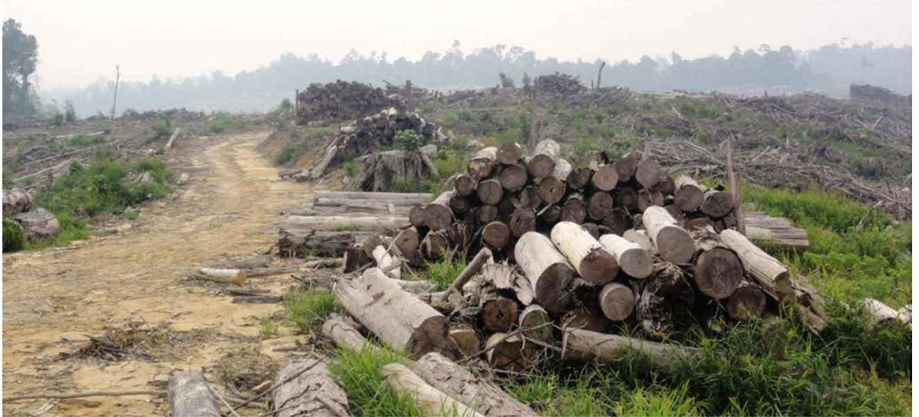
Photo 3. Logyard of PT. Artelindo Wiratama where the timber supplier of APP clearcuts tropical rainforest for raw material that would be sent to pulp mill of PT Indah Kiat Pulp & Paper (IKPP). This forest clearcutting occurs in good natural forest that should be protected as it is habitat of Sumatran tiger. Photo in GPS location S 0° 47'50.90" E 101° 50'8.63". EoF, 30 September 2011