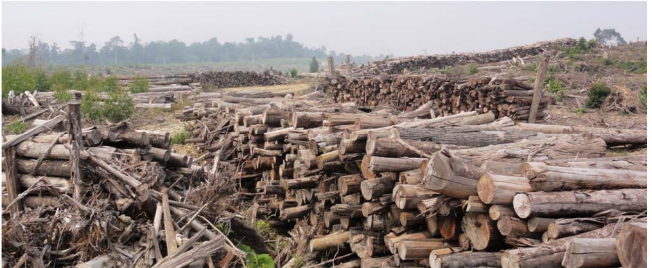
Photo 1. Logyard of PT. Artelindo Wiratama shows the timber supplier of APP clearcut tropical rainforest for raw material that would be sent to pulp mill of PT Indah Kiat Pulp & Paper (IKPP). This forest clearcutting occurs in good natural forest that should be protected as it is habitat of Sumatran tiger. GPS location at S 0° 47' 4.49" E 101° 51' 1.73". EoF, 30 September 2011