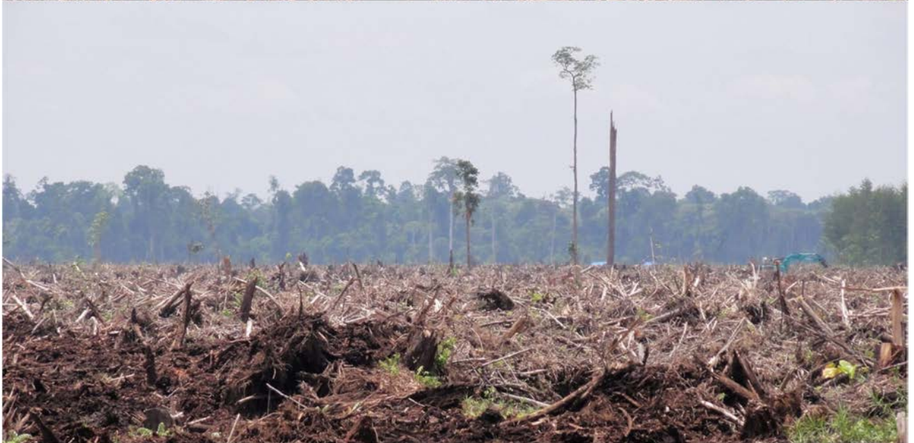
Photo 4. Vast natural forest clearcutting by PT Arara Abadi district Nilo in Tesso Nilo block. GPS location at S 0°0'45.58" E 101°56'19.70". Photo by EoF, 6 October 2011