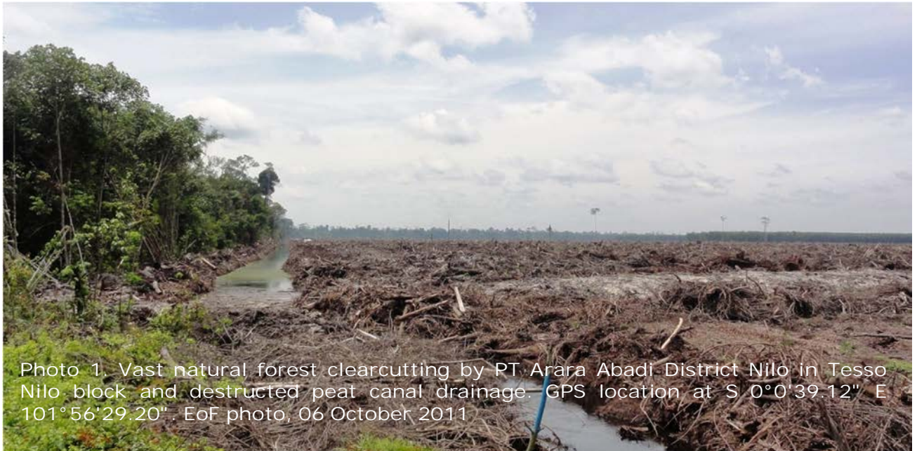
Photo 1. Vast natural forest clearcutting by PT Arara Abadi District Nilo in Tesso Nilo block and destructed peat canal drainage. GPS location at S 0°0'39.12" E 101°56'29.20". EoF photo, 06 October 2011