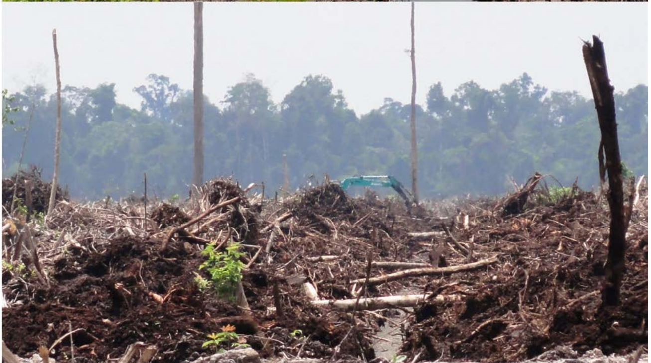
Photo 2. An excavator is working on clearcut tropical rainforest in Tesso Nilo block where APP's subsidiary PT Arara Abadi district Nilo 1 located. Peat canal drained by APP. Photo taken by EoF on 6 October 2011 at GPS position S 0°0'48.61" E 101°56'15.92".