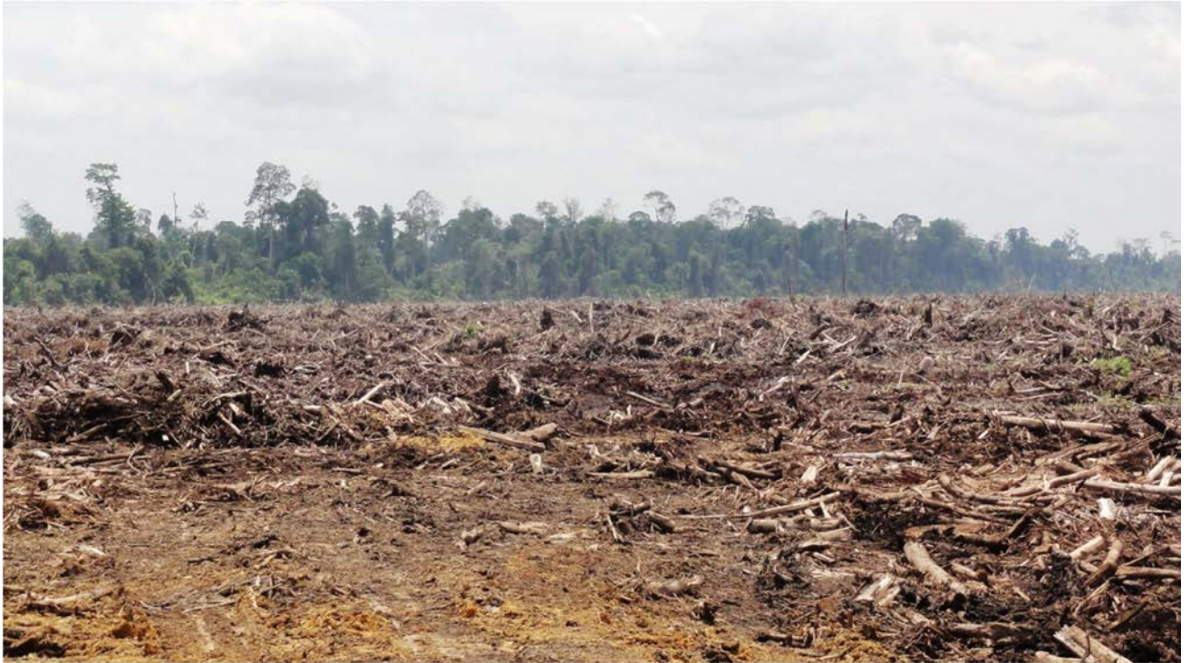
Photo 5. Vast natural forest clearcutting by PT Arara Abadi district Nilo in Tesso Nilo block. GPS location at S0°0'45.58" E 101°56'19.75". Photo by EoF, 6 October 2011