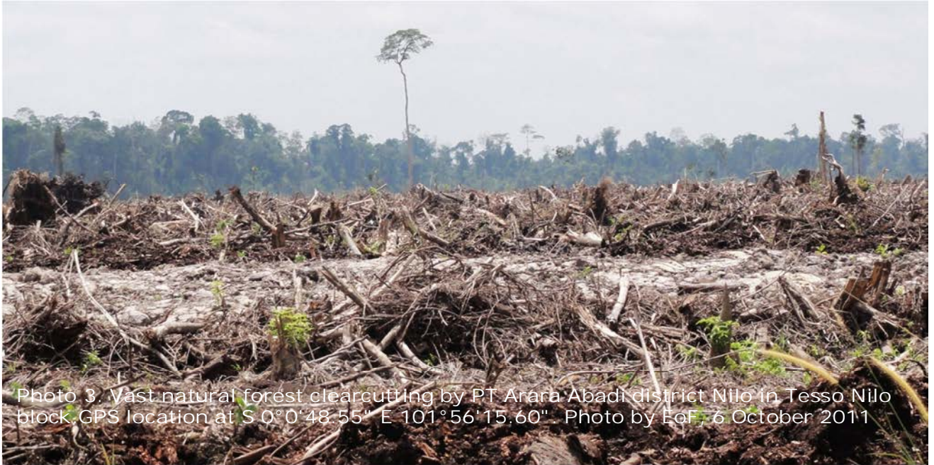
Photo 3. Vast natural forest clearcutting by PT Arara Abadi district Nilo in Tesso Nilo block. GPS location at S 0°0'48.55" E 101°56'15.60". Photo by EoF, 6 October 2011